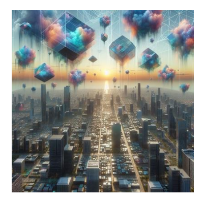
Fig 3. Various Generation Images from the Prompting